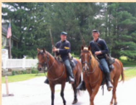
J.E.B. Stuart's cavalry arrives at Union Mills once again on July 2, on the way to reenact the Battle of Hanover.

On July 2 and 3, Union Mills Homestead will once again host J.E.B. Stuart and his cavalry, when reenactors convene and ride into Pennsylvania to reenact the Battle of Hanover at Sheppard Farm. The troops will bivouac at Union Mills the night of July 2, and visitors may join them for an all-you-can-eat pancake breakfast from 7 to 11 a.m. the next morning. Breakfast costs $6 per person and includes sausage, applesauce, coffee, and juice, along with pancakes made from the stone-ground flour of the historic mill. Guided tours of the mill and original homestead are available for a separate fee. For details on J.E.B. Stuart's Ride, go to unionmills.org or call 410-848-2288. To learn more about the battle reenactment at Sheppard Farm on July 3, visit LCACnet.org .