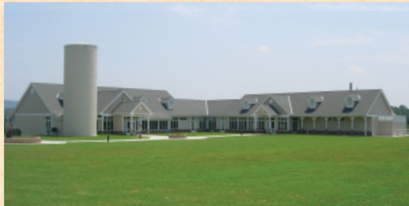
The meeting was held at one of Frederick County's newest conference facilities—Monocacy Hall at the Bishop Claggett Center, located on the Civil War Trails' Antietam Campaign trail, just south of Buckeystown.

heritage tourism programs. The trails are an appealing way to travel scenic roads, learn fascinating stories in the places where they happened, and enjoy other amenities offered by towns and cities along the way.