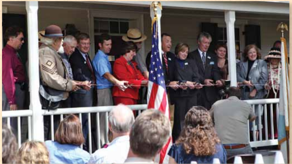
In its first two weeks of operation, the HCWHA Exhibit and Visitor Center welcomed nearly 600 people from across the United States, Germany, Sweden, England, Canada, Australia, and Hong Kong.

The Bugle Call is the official newsletter of the Heart of the Civil War Heritage Area, whose mission is to promote the stewardship of our historic, cultural, and natural Civil War resources; encourage superior visitor experiences; and stimulate tourism, economic prosperity, and educational development, thereby improving the quality of life of our community for the benefit of both residents and visitors.