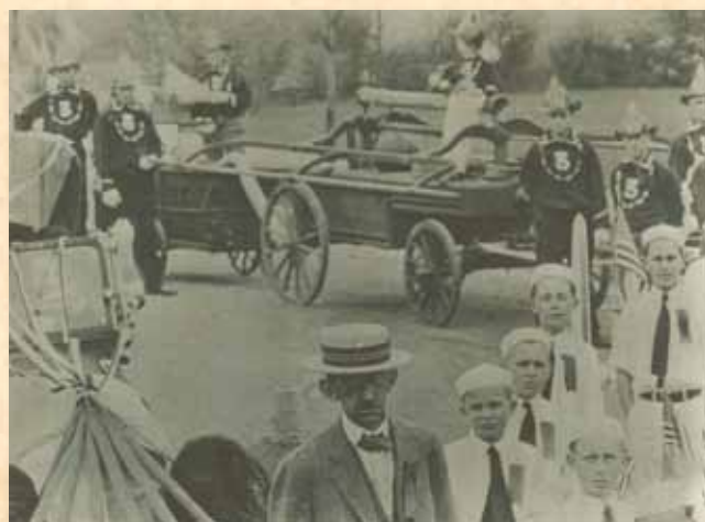
The "Old Lady" hand pumper helped to extinguish fire that destroyed Frederick's Court House in May 1861. The incidence was an apparent case of arson, in response to secession debates taking place in town. Here, the Old Lady appears in an early 20th century muster. The apparatus is now a featured artifact in the collection of the Frederick County Fire and Rescue Museum and will be on view at Frederick's Court House Square (now City Hall) for 1861 commemorations in the spring.

Numerous history and arts organizations, as well as the City of Frederick, local churches, and the Frederick County Civil War Roundtable, are collaborating to bring these programs to the community. Event details are evolving, but April promises to propel Sesquicentennial commemorations forward with sound and fury, and even a dose of fun.