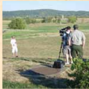
HCWHA hosts an increasing number of travel writers and journalists. Here, a crew from the UK Travel Channel is on location at Antietam National Battlefield. The crew also filmed at South Mountain State Battlefield, Monocacy National Battlefield, Mt. Olivet Cemetery, and the National Museum of Civil War Medicine.

This publication has been financed in part with State funds from the Maryland Heritage Areas Authority, an instrumentality of the State of Maryland. However, the contents and opinions do not necessarily reflect the views or policies of the Maryland Heritage Areas Authority.