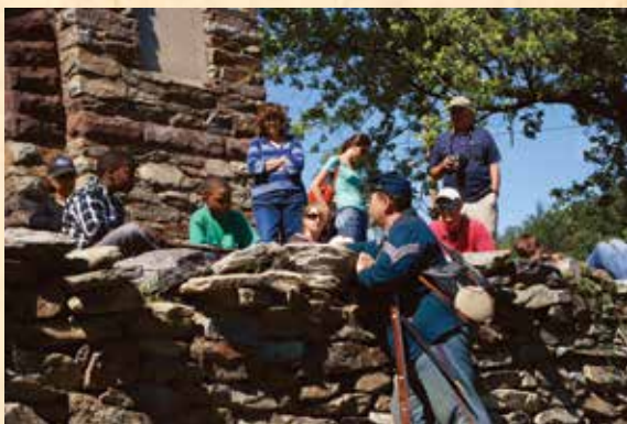
Interpreters inspire a new generation of history enthusiasts at events commemorating the 150th Anniversary of the Battle of South Mountain, at Gathland State Park in September, 2012.