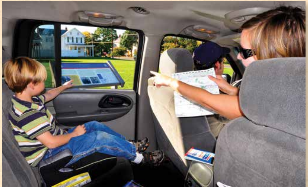
Travelers stop in Lewistown, Maryland to read a marker on the Gettysburg Campaign – Invasion and Retreat Civil War Trail.

The Bugle Call is the official newsletter of the Heart of the Civil War Heritage Area, whose mission is to promote the stewardship of our historic, cultural, and natural Civil War resources; encourage superior visitor experiences; and stimulate tourism, economic prosperity, and educational development, thereby improving the quality of life of our community for the benefit of both residents and visitors.