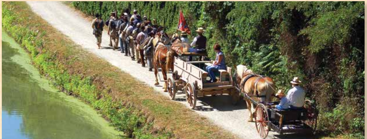
The March to Falling Waters reenactment will take place on July 14, 2014. For details visit www.williamsportretreat.com .